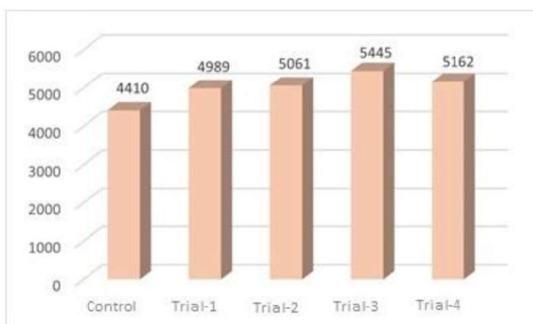
Figure 4 - Gross collection of quail eggs during the experimental period, pcs.

The experimental groups of laying hens yielded 340-532 more eggs, the best result was noted in the Trial-2 group (12570 eggs, which is 4.4% higher than the control, p < 0.01 ), in the feeding of which benzoic acid was included in the diet in the amount of 750 g/t. The gross collection is a fairly subjective indicator since its calculation is affected by a number of factors including the livability. The dates of mortality are of significant importance - the earlier the bird dies, the lower the gross collection for the flock. And vice versa, even with the same level of mortality and production performance in two groups, the gross collection will be higher where the mortality occurred at the end of the accounting period. The marketable egg indicator is more economically meaningful, in the calculation of which, in addition to the above-mentioned indices, the percentage of egg breakage is also involved. Thus, in the experiment on hens in control group 12,028 commercial eggs were obtained, in the Trial-1 group by 2.85% more (12,371 pcs) ( p < 0.01 ), in Trial-2 - by 4.44% (12,562 pcs) ( p < 0.01 ), and Trial-3 - by 3.31% (12,426 pcs), ( p < 0.01 ). Thus, in the sum of the indicators, the use of benzoic acid in feeding laying hens at a dosage of 750 g/t gives the maximum effect. When exceeding this dosage, the additional benefit was not noted.