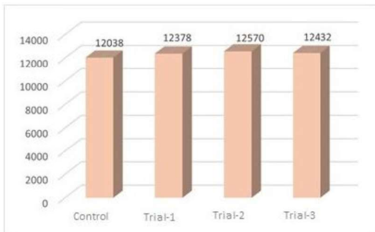
Figure 3 - Gross collection of laying hens' eggs during the experimental period, pcs.

The experimental groups of laying hens yielded 340-532 more eggs, the best result was noted in the Trial-2 group (12570 eggs, which is 4.4% higher than the control, p < 0.01 ), in the feeding of which benzoic acid was included in the diet in the amount of 750 g/t. The gross collection is a fairly subjective indicator since its calculation is affected by a number of factors including the livability. The dates of mortality are of significant importance - the earlier the bird dies, the lower the gross collection for the flock. And vice versa, even with the same level of mortality and production performance in two groups, the gross collection will be higher where the mortality occurred at the end of the accounting period. The marketable egg indicator is more economically meaningful, in the calculation of which, in addition to the above-mentioned indices, the percentage of egg breakage is also involved. Thus, in the experiment on hens in control group 12,028 commercial eggs were obtained, in the Trial-1 group by 2.85% more (12,371 pcs) ( p < 0.01 ), in Trial-2 - by 4.44% (12,562 pcs) ( p < 0.01 ), and Trial-3 - by 3.31% (12,426 pcs), ( p < 0.01 ). Thus, in the sum of the indicators, the use of benzoic acid in feeding laying hens at a dosage of 750 g/t gives the maximum effect. When exceeding this dosage, the additional benefit was not noted.