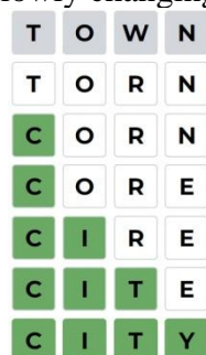
Figure 4 - An example of a solved Weaver

– Weaver is a game that has two words (usually consisting of 4 letters). The player needs to transform one word into another by slowly changing letters one by one.