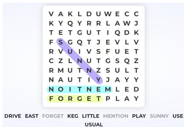
Figure 3 - An example of a Word Search puzzle

– Weaver is a game that has two words (usually consisting of 4 letters). The player needs to transform one word into another by slowly changing letters one by one.