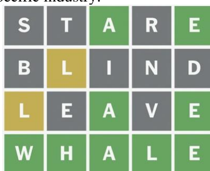
Figure 1 - An example of a solved Wordle puzzle

television game show franchise Lingo, and a colour-matching game called Mastermind, he created the game to play with his partner, eventually making it public in October 2021. The game gained popularity in December 2021 after Wordle added the ability for players to copy their daily results. Multiple clones and variations of the game were also created over the years, as were versions in languages besides English. Later, the original was purchased by The New York Times Company in January 2022 to use in the newspaper's Games section. The New York Times version can be found on their official website and can be considered to be for more advanced players and/or language learners, because the words appearing there are rarer, less known, or might belong to a specific industry.